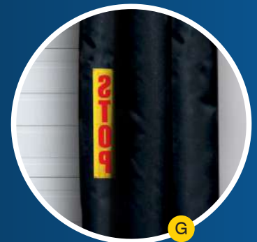
High visibility reverse 'STOP' logo