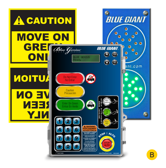
Blue Genius<sup>™</sup> Gold Series I with slim LED exterior traffic light and driver warning sign.