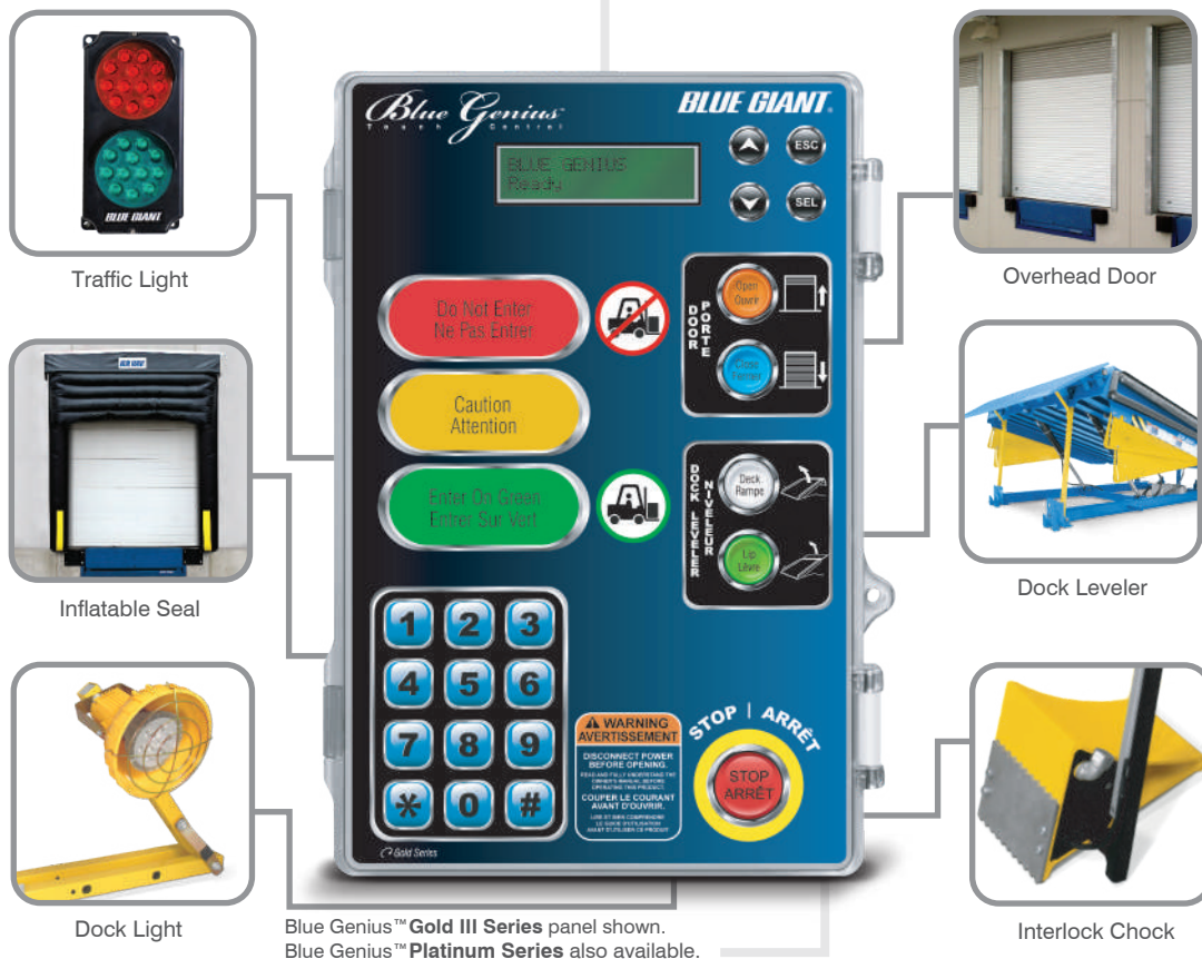
Blue Genius™ Gold III Series panel shown. Blue Genius™ Platinum Series also available.

Corporate 410 Admiral Blvd Mississauga, ON, Canada L5T 2N6 905.457.3900 f 905.457.2313