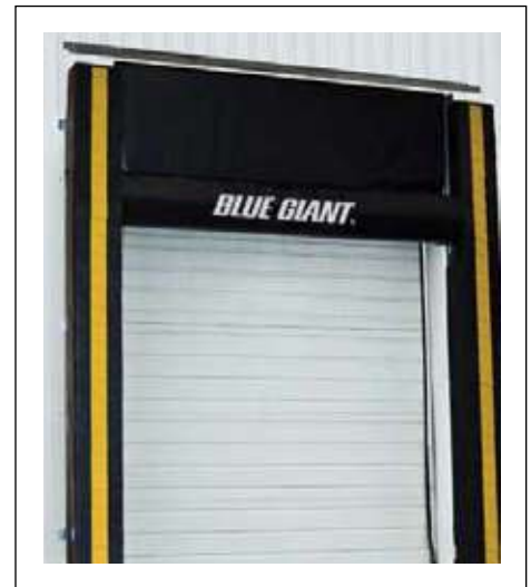
BGDSA Adjustable Head Pad Dock Seal